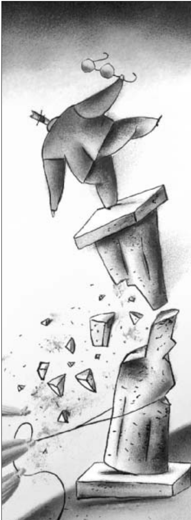
While celebrating a win is fine, declaring the war won can be catastrophic.

When it becomes clear to people that major change will take a long time, urgency levels can drop. Commitments to produce short-term wins help keep the urgency level up and force detailed analytical thinking that can clarify or revise visions.